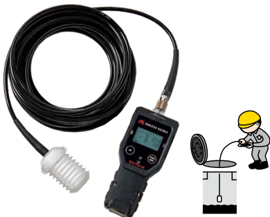
For measurements inside tanks

Can be fitted in place of the tapered nozzle provided to allow readings to be checked even from a distance.