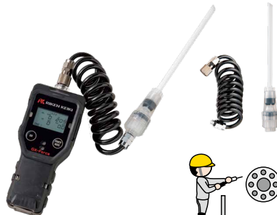
For measurements in specific locations within reach

(Tube length: approx. 8 m) Part No.: 4384 0430 60