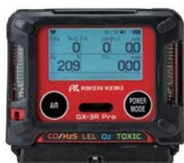
Appearance when attached