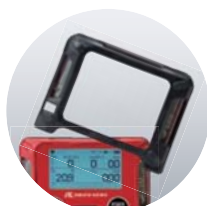
Protective cover (part No. 4777 4161 10)